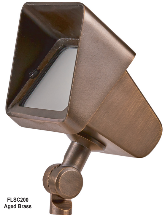
FLSC200 Aged Brass

Complies with the requirements of UL-1838 and CAN/CSA-C22.2 No. 250.7. Identified with the ETL & cETL Listed Mark