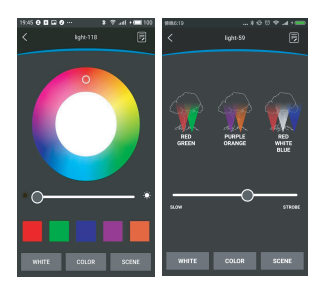
Alliance BT App Screenshots

BT ALLY Lamps use a Bluetooth Mesh network and are controlled with the Alliance BT App available for Apple and Android Devices. The App provides total control over all fixtures on the Site's Mesh Network. Features Include RGB Tuning with 30,000 Colors, Preset Colors, Dimming from 1% to 100%, Scene Control & Theme Creation, and White Color Tuning from 2700K to 4000K.