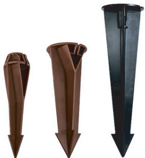
P1 (8") P2 (8.5") P3 (14")

SLOTTED GROUND STAKES (STK) Plastic Ground Stakes With Wiring Slots and 1/2" NPT Threading. Aged Brass Or Black.