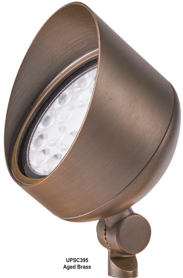
UPSC395 Aged Brass

Complies with the requirements of UL-1838 and CAN/CSA-C22.2 No. 250.7. Identified with the ETL & cETL Listed Mark