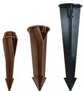
P1 (8") P2 (8.5") P3 (14")

SLOTTED GROUND STAKES (STK) Plastic Ground Stakes With Wiring Slots and 1/2" NPT Threading. Aged Brass Or Black.