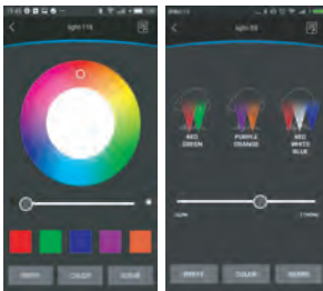
Alliance BT App Screenshots

BT ALLY Lamps use a Bluetooth Mesh network and are controlled with the Alliance BT App available for Apple and Android Devices. The App provides total control over all fixtures on the Site's Mesh Network. Features Include RGB Tuning with 30,000 Colors, Preset Colors, Dimming from 1% to 100%, Scene Control & Theme Creation, and White Color Tuning from 2700K to 4000K.